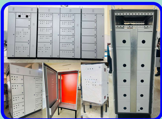
MCC Panel and Enclosures